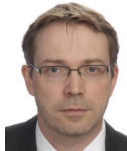
Andrew Parrott